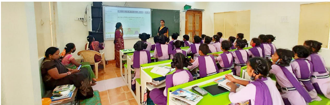
Teachers and Students Using the ReadToMe® School Edition. 6

Utilizing Intel architecture and AWS technology, EH can now achieve uninterrupted scalability in the near future and implement their solutions in more than 100,000 schools across all states in India. This solution will effectively help EH make a lasting impact on the lives of over 20M students and 500,000 teachers 3 , enabling them with improved learning abilities and promoting continual growth and progress.