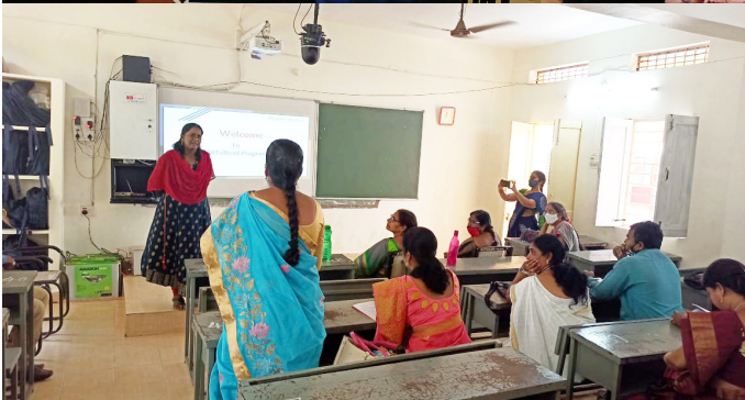
EnglishBolo ™ session for teachers to aid with better training tools. 6