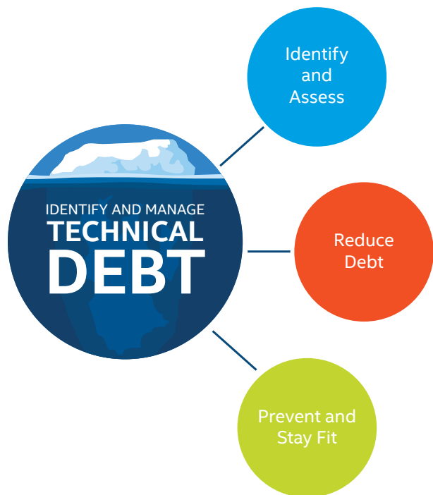
Figure 2. Consisting of three steps—identify and assess, pay and reduce, and prevent and stay fit—our unique technical debt framework spans the business, data, application, and technology domains.

Sporadically pursuing technical debt is not very effective. Instead, we use a framework to guide our technical debt efforts. This framework is holistic, in that it encompasses the full scope of technical debt to drive prioritization, aid in decision making, and fuel digital transformation. Our unique framework spans the entire business, data, application, and technology (BDAT) domains. Figure 2 provides a high-level summary of the three phases of our technical debt framework. See “ Applying the Technical Debt Framework ” for more details.