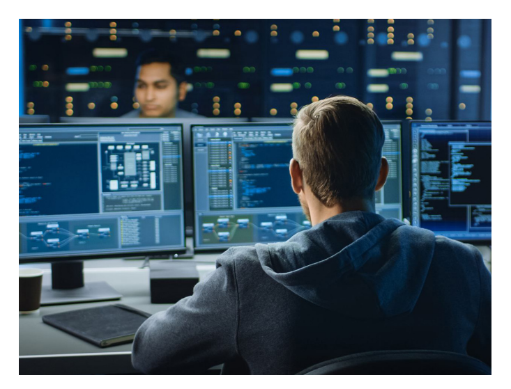
Aible's serverless approach supported by Intel® Xeon® processors could demonstrate up to a 55X reduction in total cost of ownership for GenAI workloads.

resources through a pay-as-needed model. Time-to-value is also a critical factor for customers. Some spend millions of dollars making GenAl investments and need the fastest ROI possible.